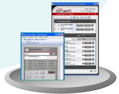
Avaya one-X Portal Avaya one-X Desktop