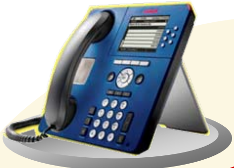
Avaya One-X™ Deskphone