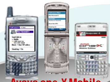
Avaya one-X Mobile