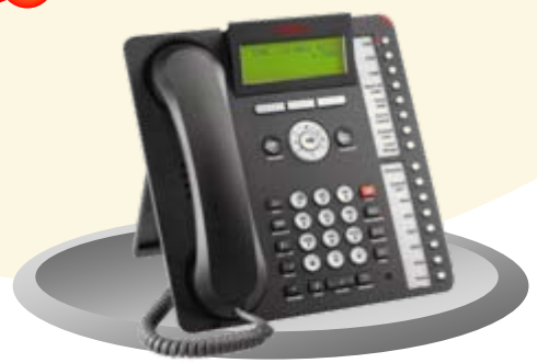
Avaya One-X Deskphone Value Edition