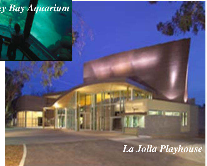
La Jolla Playhouse