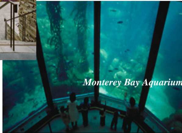
Monterey Bay Aquarium