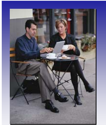
Even Cafés & Restaurants