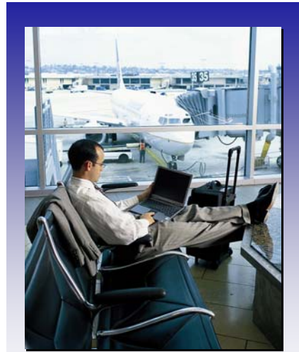
In Airports and Hotels